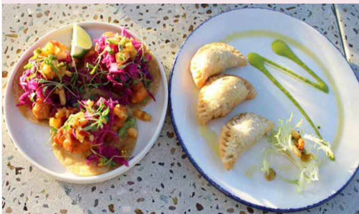
Yellow tail beer battered tacos with a citrus slaw (left) and short rib empanadas with pickled raisins.