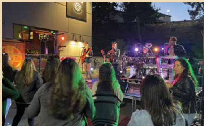
The 80's band REFLEXX kept everyone on the dance floor