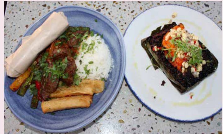
Authentic Peruvian Steak Fajitas (left) and Chilean Seabass entrees.