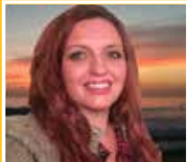
Sandra White Display Advertising

Editorial offices: 520 E. Avenida Pico Ste. 3322 San Clemente, CA 92674