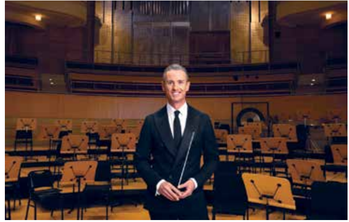
Alexander Shelley

Shelley's experience has been highlighted by a strong commitment to education and community engagement. With NACO, he has led innovative festivals, such as SPHERE and Ideas of North, and tours that celebrated Indigenous stories and music, including a historic performance on Eskasoni First Nation Reserve. He conceived and spearheads the NAC Mentorship Program, designed to nurture the next generation of musicians, ensuring that