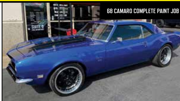
68 CAMARO COMPLETE PAINT JOB