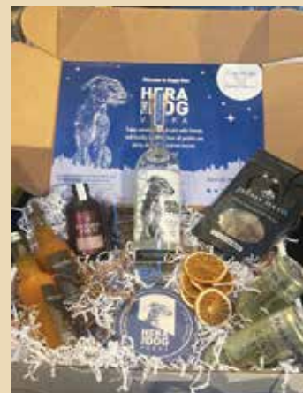
The Hera the Dog Vodka Holiday Cocktail Kit