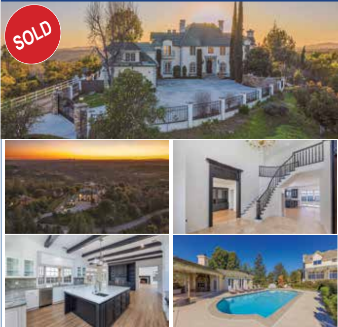
Fallbrook I Sold for $2,400,000 3875 Peony Dr. 15 bedrooms 5.5 bath 6,550 sq. ft. approx. Does not include guest quarters & pool house