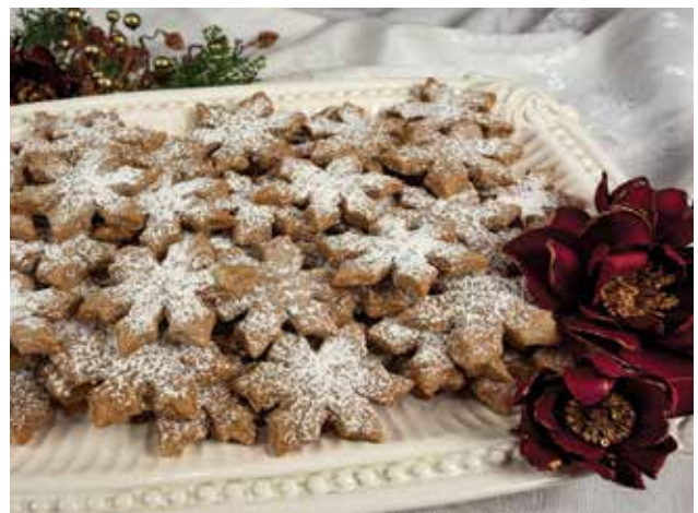
Christmas Cinnamon Cookies