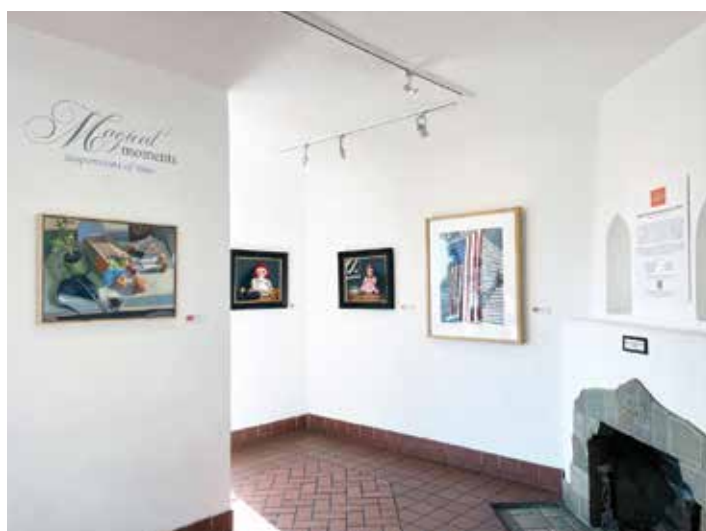
Magical Moments: Suspensions of Time

The foaSouth gallery is part of the Festival's commitment to providing year-round art experiences for the public. As a nonprofit organization, the Festival of Arts supports the arts in and about Laguna Beach through exhibitions,