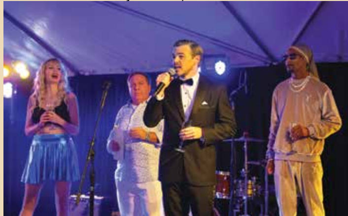
Part of the entertainment featured impersonators of "Taylor Swift," "Frank Sinatra," and "Snoop Dogg"